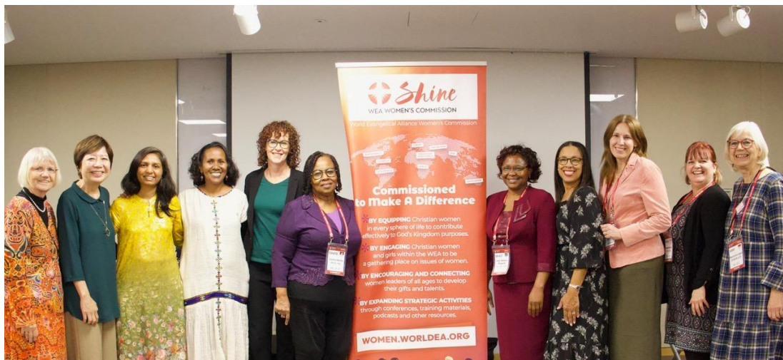
To God be the glory! Regional Leaders and the Executive Team